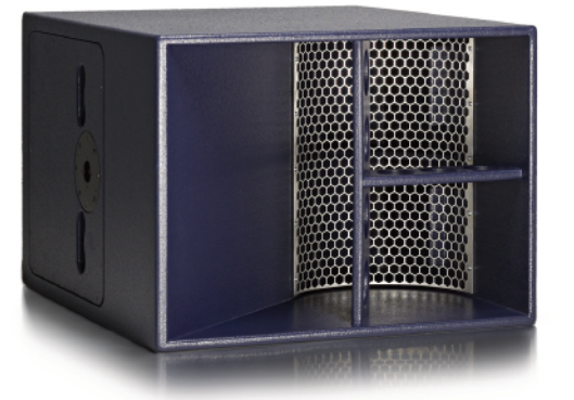
Shown with optional stainless steel throat grille

It provides strong, well-defined, clean bass from a small and manageable package. The F118 Mkll can be supplied with an optional pole mount for use with a wide range of mid-high products including the F101, F1201, F88, R1 and R2SH. An installation version of this enclosure with flying points is also available, which can be effectively used to provide bass extension in distributed audio applications.